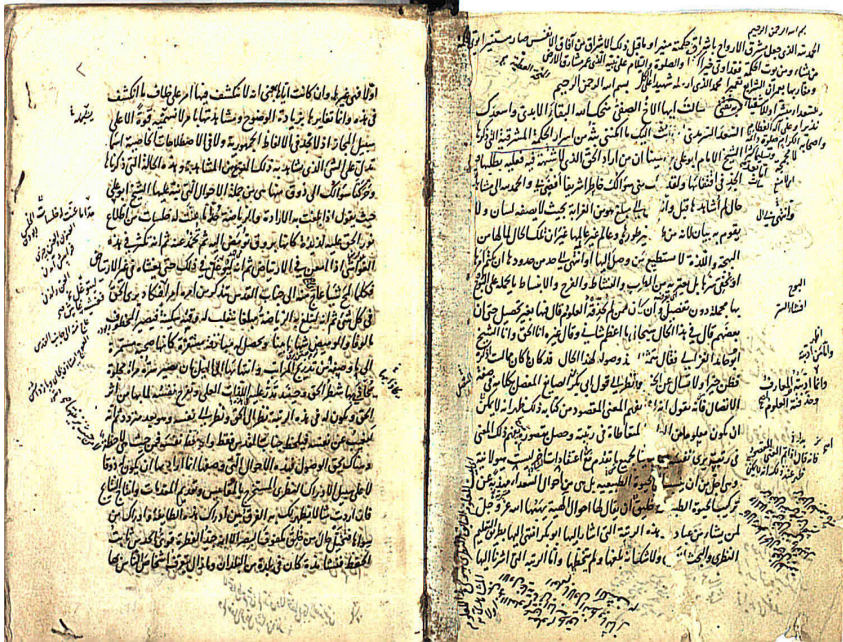
Figure 1: The first two pages of a manuscript containing the text of Ibn Tufayl's Hayy ibn Yaqzan , ms. Istanbul, Ayasofya 04807-001.

collective noun, on the other hand, it refers in classic Arabic also to the “core bond” and thus the “life source” of a tribe or clan. In this regard, it is a designation for “life” in the best sense of the word and may also be understood as a synonym for “people” or “humanity” in general.